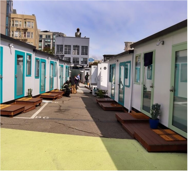
San Francisco & Santa Barbara build faster on parking lots.