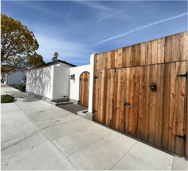
Santa Barbara's site blends seamlessly into downtown.