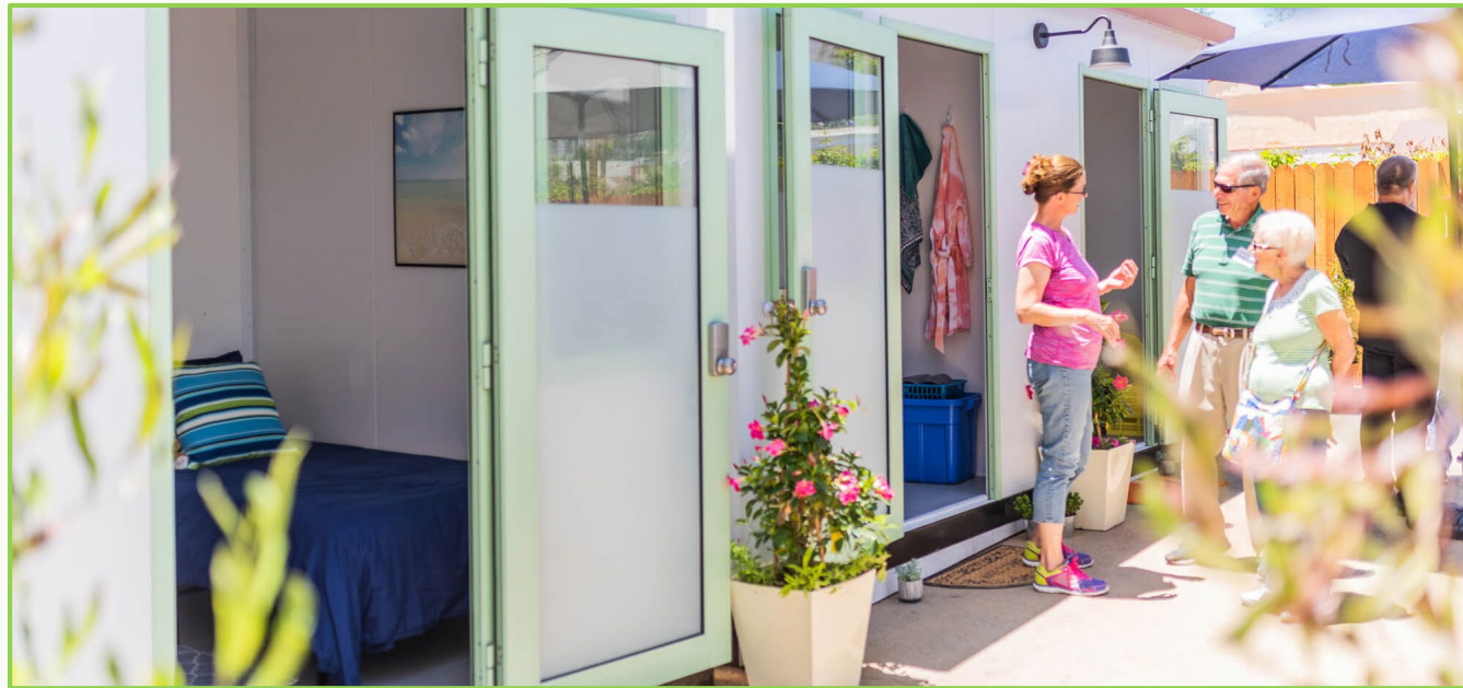
DignityMoves Santa Barbara pilot interim housing