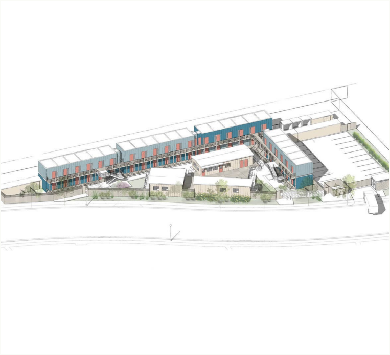
Alameda's site takes advantage of available real estate.